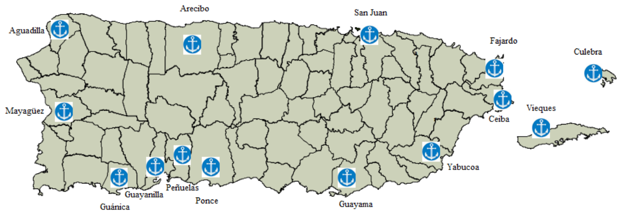
Exhibit 5.7. Puerto Rico’s major seaports.

Without further investigation, it is difficult to determine the accuracy of the QCEW data for the ENOW Marine Transportation sector. However, according to both PRPA and the Puerto Rico Marine Transportation Authority (MTA), the QCEW establishment and employment numbers seem a bit low. The representatives we met with from the PRSA also believe that the sector is underrepresented, specifically in terms of the employment data for marine cargo handling, port and harbor operations, and warehousing. As described below, based on our own research, we have also identified some gaps in the ENOW data for this sector.